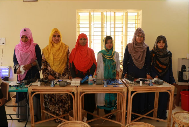
Volunteers in Camp 4: "Our suggestion is to give jute bags to the beneficiaries. It's less fragile and they will be able to use it for a long time"