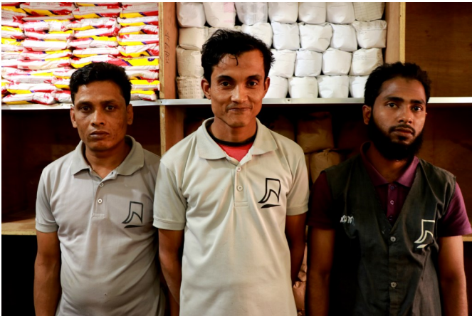
Retail staff at Camp D5 outlet: "We are working round the clock to sensitize the beneficiaries on the positive impact of using paper bags. I think gradually they are understanding the benefits."