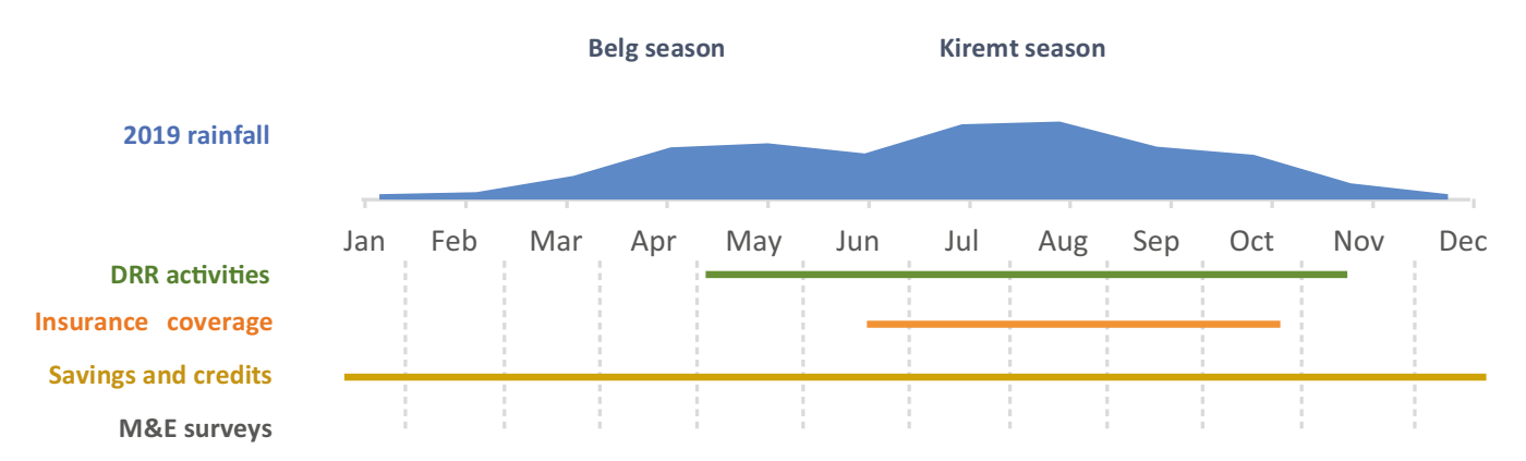
FIGURE 2. Ethiopia 2019 seasonal calendar

In Amhara, a total of 4,407 farmers participated in 218 saving groups, saving a total of US$42,715 (ETB 1,252,339) from VESAs and US$4,456 (ETB 130,665) from RUSACCOS. A total of 2,943 farmers (34 percent women) accessed loans worth US$44,467 (ETB 1,303,695) with a repaid loan amount of US$27,234 (ETB 798,470). During the quarter, 186 farmers (15 percent women) attended trainings on Nutrition and Gender, Business Plan and Financial Literacy, and Livelihood and Value Chain in Tigray. Moreover, 2,193 farmers (38 percent women) were trained in business skills and financial literacy. In Amhara, 253 farmers (24 percent women) participated in Financial literacy trainings and 122 farmers (18 percent women) were trained in VESA methodology.