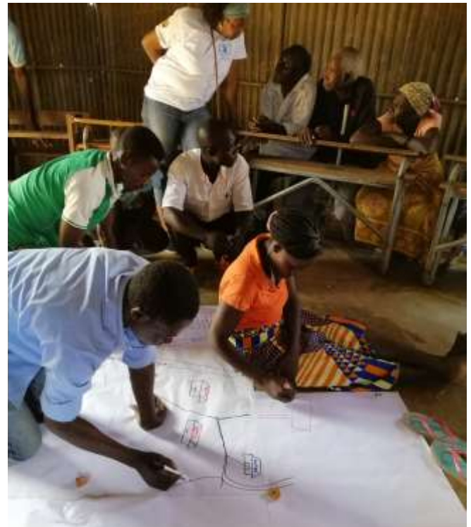
Community-Based Participatory Planning exercises in Tete Province, Mozambique.

In response to the devastation caused by cyclones Idai and Kenneth, WFP Mozambique has developed a 3-year recovery and resilience strategy that prominently includes FFA activities. A phased approach will be taken to FFA programmes, as communities engage in more labor-intensive and more complex asset creation activities over time. Emphasis will also be given to a nutrition-sensitive approach in FFA activities.