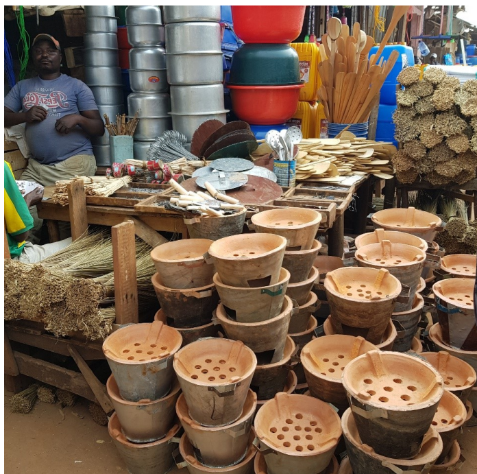
Cookstoves sold among other household items in markets.

Energy powered storage and handling (e.g. refrigeration, drying, smoking, pasteurization, fermentation, canning and packaging) reduce post-harvest food loss and improve food quality, increasing availability of nutritious foods at the household level and enabling farmers to control the timing of crop sales, improving household income.