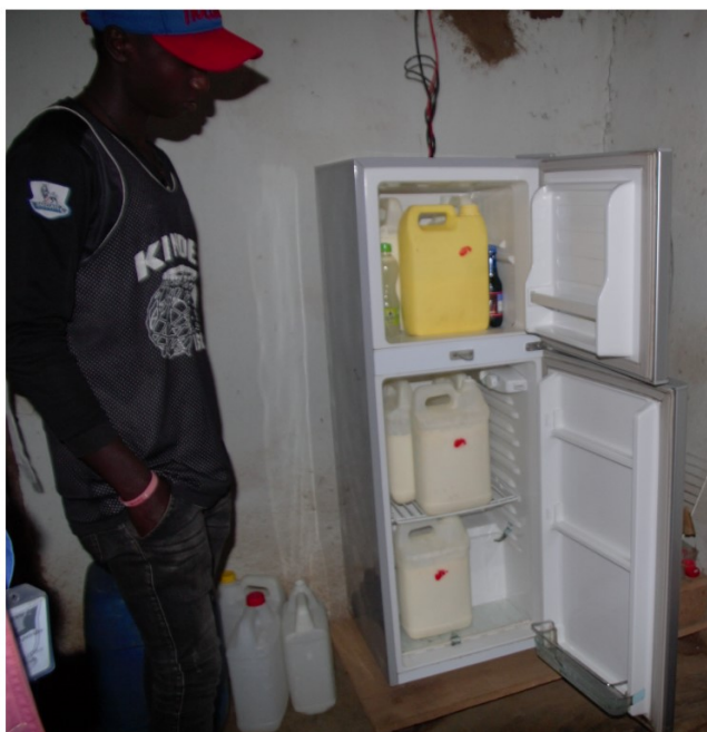
Solar powered fridge enables the conservation of milk in a cafeteria in Ruyigi camp, Burundi.

Access to energy can support WFP in contributing to the 2030 Agenda in most contexts where it is active, spanning from acute emergency to building long-term resilience. Leveraging the technical expertise of the engineering department and the extensive logistics infrastructure, WFP is in a unique position to address the energy gaps that impact food security through relentlessly testing innovative solutions and delivery models, while scaling up proven approaches.