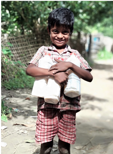
Photo: A young boy in Rakhine State seen with WFP's oil rations