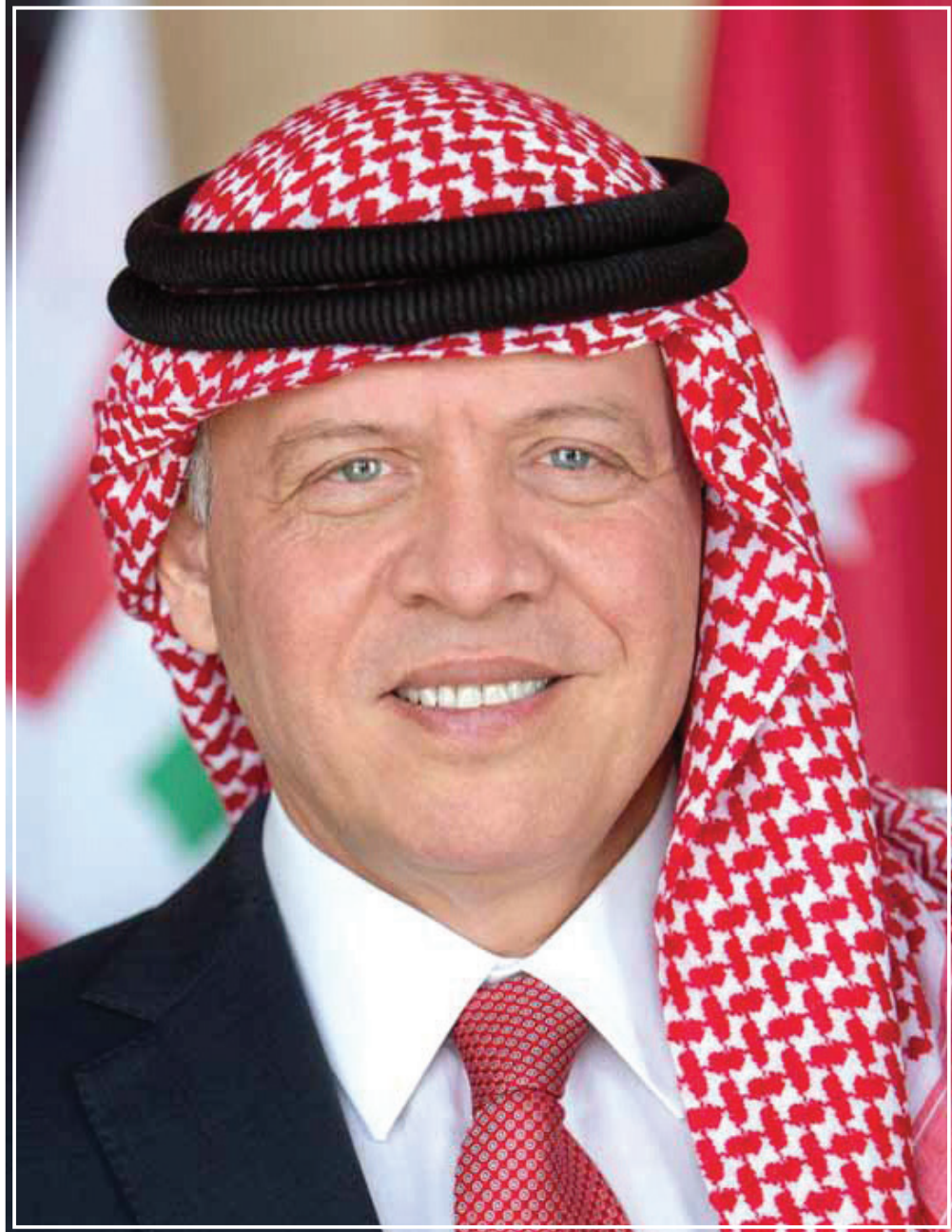
His Majesty King Abdullah II bin Al Hussein