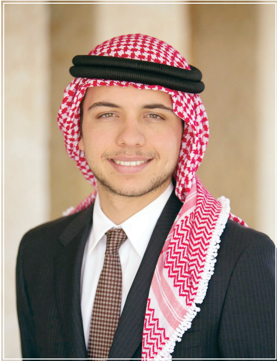
HRH Crown Prince Hussein bin Abdullah II