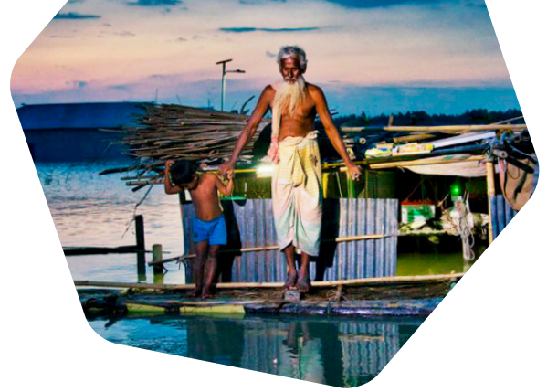
A man and his grandson stand on a raft made from a banana tree, in front of his submerged house.

Differences in beneficiary selection procedures also influence the choice of financial providers and the speed with which funds are dispersed. As WFP has a pre-established list of potential beneficiaries across five districts, it can work with bKash, one of Bangladesh’s largest financial service providers, which has ‘cash-out’ agents in every village. Because WFP pre-selects beneficiaries during the preparedness phase, it can have their financial details ready and transfer the funds very quickly upon activation.