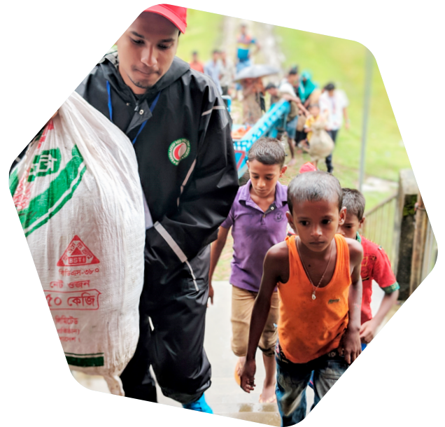
BDRCS simulating an evacuation.

Despite these differences in approach, BDRCS, GRC and WFP were working on FbF for flooding and soon recognized the potential of collaboration to increase learning, to expand the reach and impact of FbF, and to avoid duplication. In October 2018, WFP, BDRCS and GRC, as well as the Swiss Red Cross, the American Red Cross and the International Federation of Red Cross and Red Crescent Societies (IFRC) country office in Bangladesh, signed an Agreement of Cooperation. In this, all parties recognized that “close cooperation, collaboration, and coordination” in the development and testing of various elements of FbF “will enhance the early actions and the humanitarian service provided to affected populations” (AoC, 2018; p.1, point E).