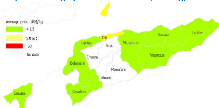
Map. 2: Average price of imported rice (US$/kg)