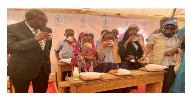
MINEPIA tastes the deliciousness of locally sourced and produced meals

According to the November 2021 Cadre Harmonisé, it is projected that more than 442,000 persons will be severely food insecure in the East, Adamawa and North regions between June and August 2022, a 77 percent increase from the same period in 2021.