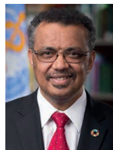
Dr Tedros Adhanom Ghebreyesus Director-General World Health Organization

The Standards will play an important role in strengthening primary care and advancing progress towards universal health coverage for all, including refugees and migrants. Successful roll-out will require the commitment of all countries to support and invest in their health workforces.