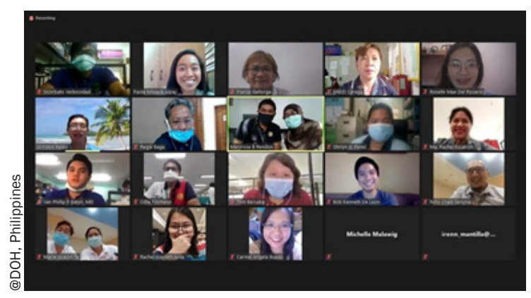
Virtual consultation on routine community deworming, Philippines, 26 May 2020

DOH Memorandum 2020-0260 (Interim Guidelines on Integrated Helminth Control Program and Schistosomiasis Control and Elimination Program during the COVID-19 Pandemic) and DOH Circular 2020-0302 (Delivery of Routine Deworming Services under the Integrated Helminth Control Program during the COVID-19 Pandemic) laid out options on how to conduct routine deworming for the July 2020 Deworming Campaign, using a fixed-post approach (barangay health centres, barangay outposts, private clinics and churches) along with outreach or home visit approaches. These strategies were discussed virtually with the regional implementers and various programme stakeholders on 26 May 2020.