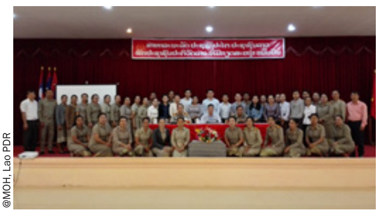
Participants at the training session on the integrated school curriculum on rabies prevention and control, Xayabouly province, Lao PDR, September 2020

A World Rabies Day event to raise public awareness about rabies prevention and provide free dog vaccination was held in Vientiane Capital and Xayabouly province. The event was chaired by the Vice Minister of Health, Vice Minister of Agriculture, WHO Representative and FAO Representative in Lao PDR. It was held on 28 September 2020 in Vientiane Capital, and on 1 October 2020 in Xayabouly province.