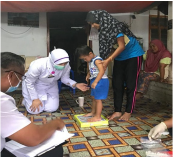
LF MDA campaign with triple drug therapy, using preventive measures against COVID-19 in Sarawak State, Malaysia, December 2020

The LF transmission assessment survey (TAS) overcame significant challenges arising from continuing school closures due the COVID-19 pandemic. The LF team in Sabah organized home visits to conduct the survey, while in Sarawak students were gathered at the community hall, keeping social distance and ensuring preventive measures against COVID-19.