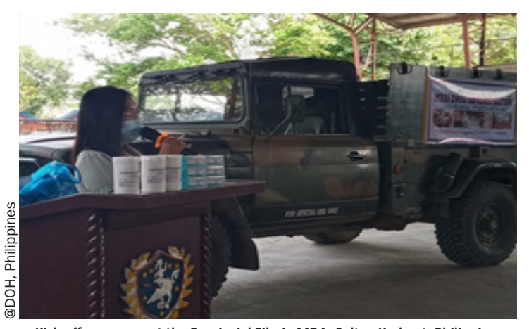
Kick-off ceremony at the Provincial Filaria MDA, Sultan Kudarat, Philippines 17 August 2020

The National Filariasis Elimination Program (NFEP) continued its campaign in spite of the Covid-19 pandemic. The Department Circular for the Delivery of Routine Services under NFEP during the COVID-19 Pandemic and the Department Memorandum Interim Guidelines on the Delivery of Routine LF MDA under NFEP during the COVID-19 Pandemic were both issued to ensure safe and effective delivery of routine services amid the pandemic. Accordingly, scheduled activities such as community-based TAS, special surveys and MDA campaigns were carried out by the Filariasis Program.