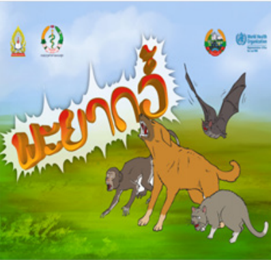
Poster and flip book produced in July-August 2020 on rabies prevention and control for use in primary and secondary school curricula in Lao PDR