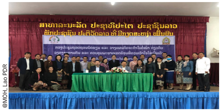
NTD Annual Partners Meeting, Vientiane, Lao PDR, 14 - 15 December 2020

The NTD Annual Partners Meeting was convened in Vientiane from 14 to 15 December 2020 to share progress, challenges and lessons learnt in controlling priority NTDs, namely soil-transmitted helminthiasis, schistosomiasis and opisthorchiasis. The meeting was chaired by the Vice Minister of Health, Vice Minister of Education and Sport, and the WHO Representative and attended by representatives from both ministries at national and provincial levels.