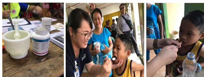
Crushing of tablets using mortar and mixing with melted chocolate for children during the MDA in Sarawak, April 2019