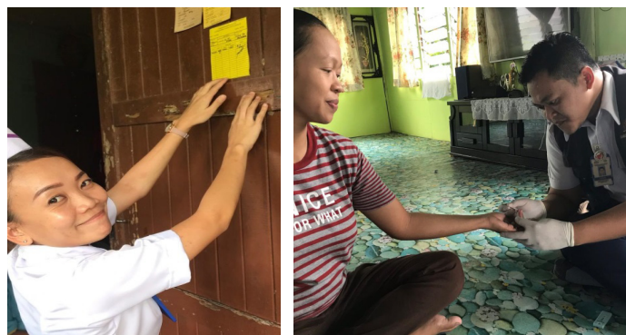
Use of house card tagging of every house visited to ensure the actual number of population during the MDA in Sarawak, April 2019 (left photo); Testing of non-eligible individuals for MDA (pregnant mothers, the medically unfit and breastfeeding mothers) during the MDA in Sarawak, April 2019 (right photo)

Both meetings were joined by the representatives of the Papua New Guinea Institute of Medical Research and Case Western University, which will collaborate with NDOH in the monitoring and evaluation study of the triple drug MDA. This latter was funded by the Bill and Melinda Gates Foundation, JICA and WHO, which support field implementation of MDA campaigns, and the Provincial Health Agency, Provincial LF Task Force and selected district health agencies of East New Britain Province.