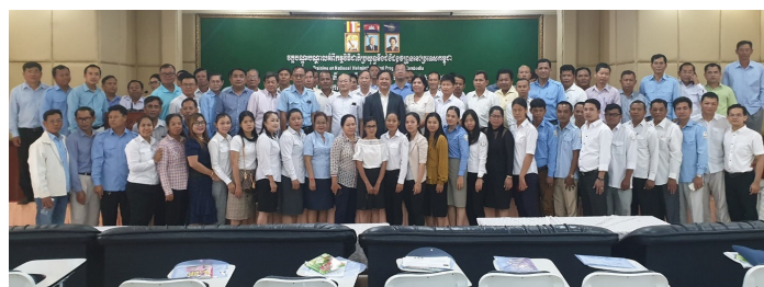
Training workshop on control of neglected tropical diseases for provincial and district focal points, Kampong Cham, Cambodia, 11-12 June 2019.