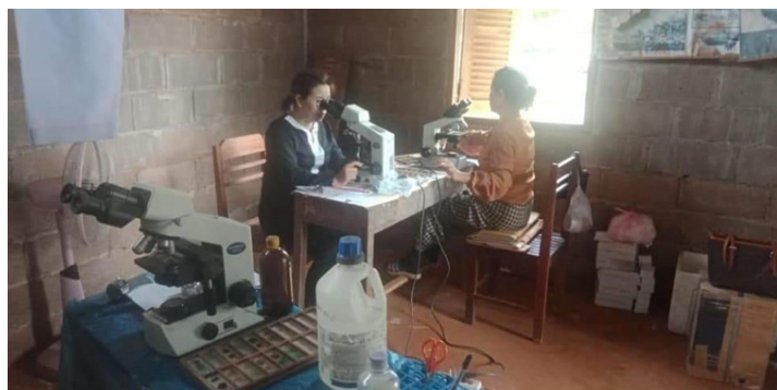
Stool examination on taeniasis and opisthorchiasis in Champhone district, Savannakhet province, May 2019

The Ministry of Health Malaysia, with WHO support, organised a training workshop on introduction of triple drug therapy to accelerate elimination of LF in Betong district, Sarawak State on 12 February 2019. The training workshop was attended by all health staff and nurses from the district and neighbouring districts, and epidemiologists and members of vector-borne disease units in Sarawak State Health Department who are involved in the upcoming MDA campaign, as well as the LF team from Sabah State, where the MDA campaign using triple drug therapy was to be implemented in hotspots.