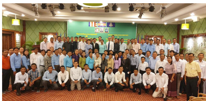
National consultation workshop to finalize the national action plan for control and elimination of NTDs, Siem Reap, Cambodia, 30-31 January 2019

The two-day national workshop to finalize the National Action Plan for Control and Elimination of Neglected Tropical Diseases in Cambodia (2019-2024) was organised by the National Helminth Control Program (Ministry of Health) on 30-31 January 2019. Multiple ministries, institutions and development partners from national and provincial levels such as the Ministry of Health (Department of Communicable Diseases, Department of Drugs and Food, Department of Preventive Medicine, Central Medical Store, and Provincial Health Department), the Ministry of Rural Development (Department of Rural Health, Department of Rural Water Supply, and Provincial Department of Rural Development), the Ministry of Education, Youth and Sport (Department of School Health and the Provincial Department of Education, Youth and Sport) and the Ministry of Labour and Vocational Training (Department of Occupational Safety and Health) participated. They discussed priority actions in the coming five years to achieve control and elimination of NTDs in Cambodia.