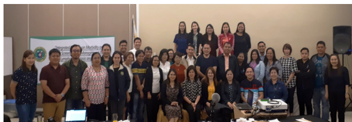
Integrated morbidity management and disability prevention training, Manila, Philippines, 26-28 March 2019

The first consultation meeting on the development of a deworming package for the private schools in high risk areas was held on 23-25 April 2019 in Manila. The consultation was attended by the DOH national program manager, selected regional Integrated Helminth Control program coordinators and partners from selected LGUs as well as representatives of the Department of Education. The consultation drafted a guideline on the implementation of deworming in private schools and comprehensive intervention packages for soil-transmitted helminthiases in risk areas.