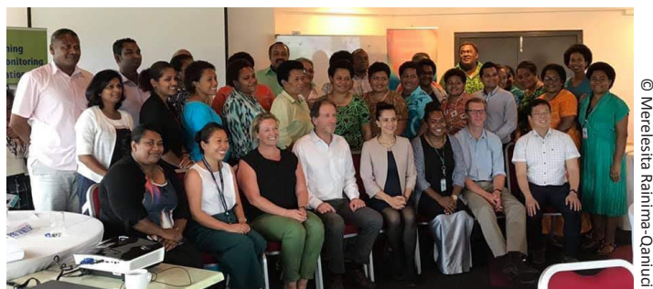
The national LF taskforce meeting in Suva, Fiji, 28-30 January 2019

was Vatulele island, where the total population of 1 532 people above the age of one was targeted for deworming using a community-based approach. 87% coverage was achieved. Deworming is integrated into the Health Promoting School campaign and 194 primary schools, comprising 26% of the primary schools in Fiji, are currently covered under this programme.