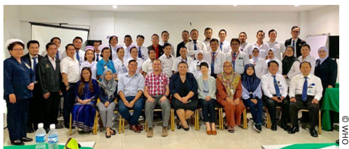
Training workshop on introduction of the triple drug therapy in Sarawak and Sabah State for accelerating elimination of LF, Betong district, Sarawak, Malaysia, 12 February 2019

The Ministry of Health Malaysia, with WHO support, organised a training workshop on introduction of triple drug therapy to accelerate elimination of LF in Betong district, Sarawak State on 12 February 2019. The training workshop was attended by all health staff and nurses from the district and neighbouring districts, and epidemiologists and members of vector-borne disease units in Sarawak State Health Department who are involved in the upcoming MDA campaign, as well as the LF team from Sabah State, where the MDA campaign using triple drug therapy was to be implemented in hotspots.