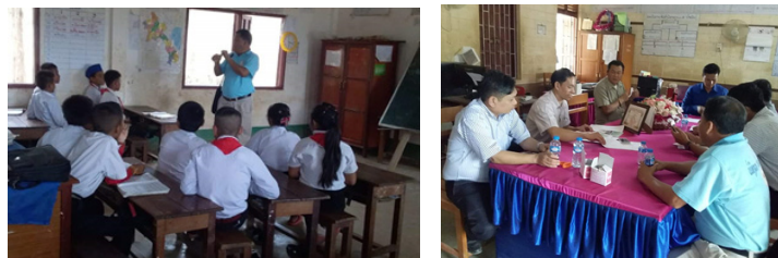
Supervisory visit by the central school deworming team in Vientiane province, April 2019