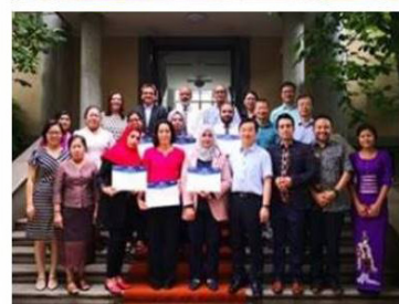
Training course on schistosomiasis diagnosis in the near-elimination phase in Shanghai, China, 10-21 June 2019