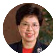
Margaret Chan Director General World Health Organization

"Everyone with TB should have access to the innovative tools and services they need for rapid diagnosis, treatment and care. This is a matter of social justice, fundamental to our goal of universal health coverage. Given the prevalence of drug-resistant tuberculosis, ensuring high-quality and complete care will also benefit global health security. I call for intensified global solidarity and action to ensure the success of this transformative End TB Strategy."