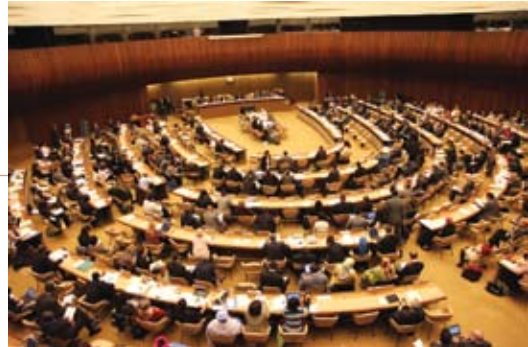
↑ Sixty-third World Health Assembly 2010, Committee A on IHR implementation

For the World Health Organization, 2010 was a year of great challenges. In 2009, for the first time since their entry into force in June 2007, the revised International Health Regulations (IHR) were put to the test by pandemic H1N1 2009. And at the start of 2010, as the pandemic continued to make its way around the globe, the external review of WHO's response to the pandemic began its deliberations.