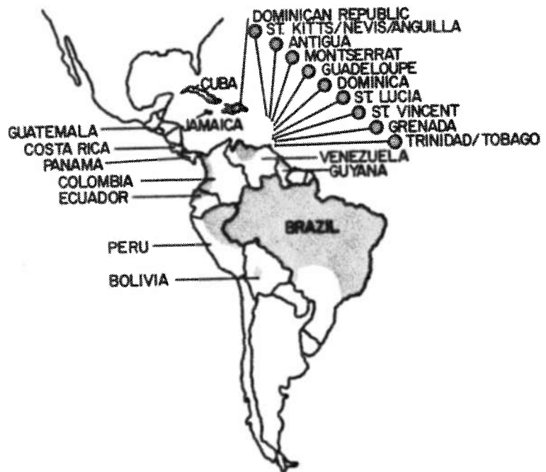
Figure 1. Areas (shaded) where yaws was endemic in the Americas in 1955 [12, 13].

In July 1950, Haiti began a mass campaign against yaws, the first such "pilot project" in the hemisphere, with the assistance of the Pan American Sanitary Bureau (PASB; later called the Pan American Health Organization [PAHO]), the World Health Organization (WHO), and the United Nations Children's Emergency Fund. The original strategy called for treatment of clinically apparent cases of yaws at "collecting points" in temporary field clinics [10]. This strategy was