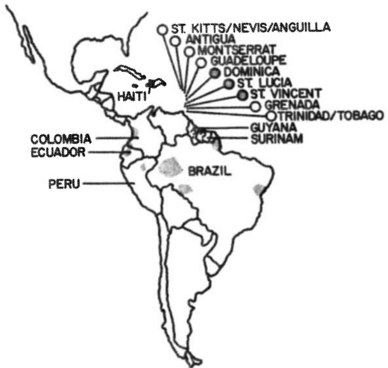
Figure 3. Areas (shaded) where yaws was endemic in the Americas in 1975 [32].

paign against yaws at about the same time [32]. These two countries reported 416 of the 437 cases officially reported in the Americas in 1975. I am aware of unofficial reports of a few cases of yaws in Guiana and Surinam in recent years, but the status of the disease in those two countries is uncertain.